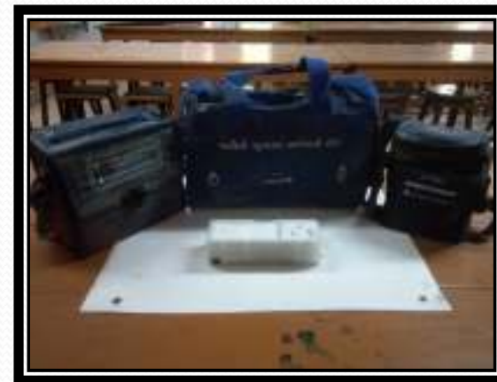
WATER TESTING KIT