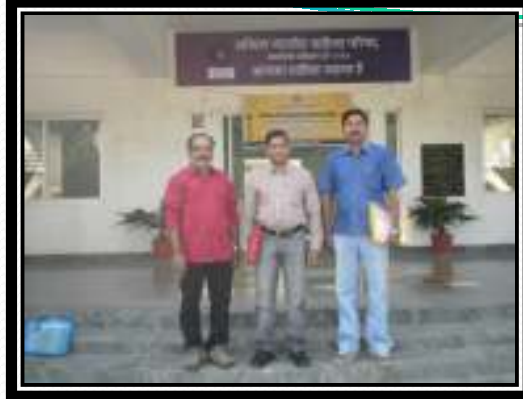
International Conference At Japan