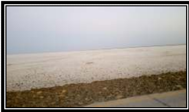
White Desert Kutchh