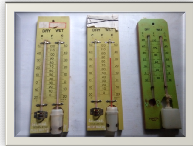
DRY WET THERMOMETER