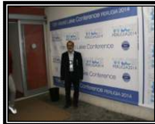
International Conference At Perugia-Italy