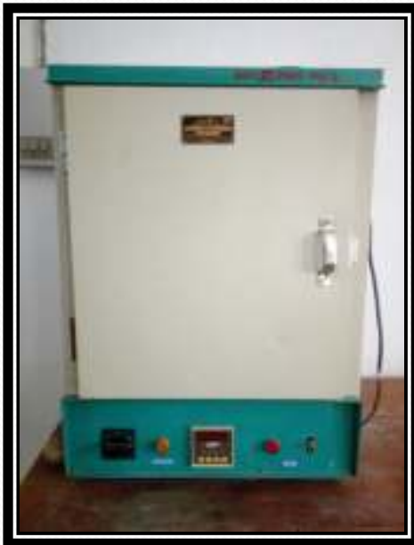
← OVEN →