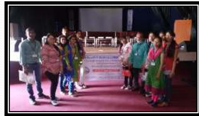
Gujarat Science Congress At Kutchh