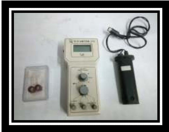
D O METER