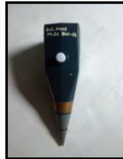
SOIL PH,MOISTURE TESTER