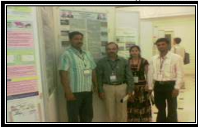
International Wetland Conference at Ujjain