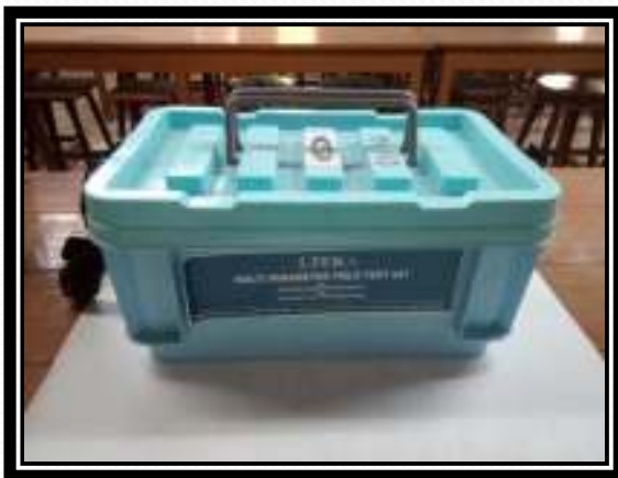
FIELD TEST KIT