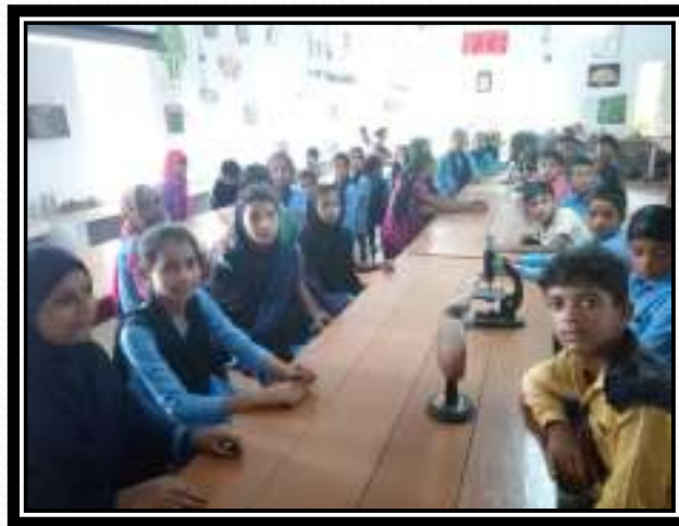
Dept. Visit by School Childs